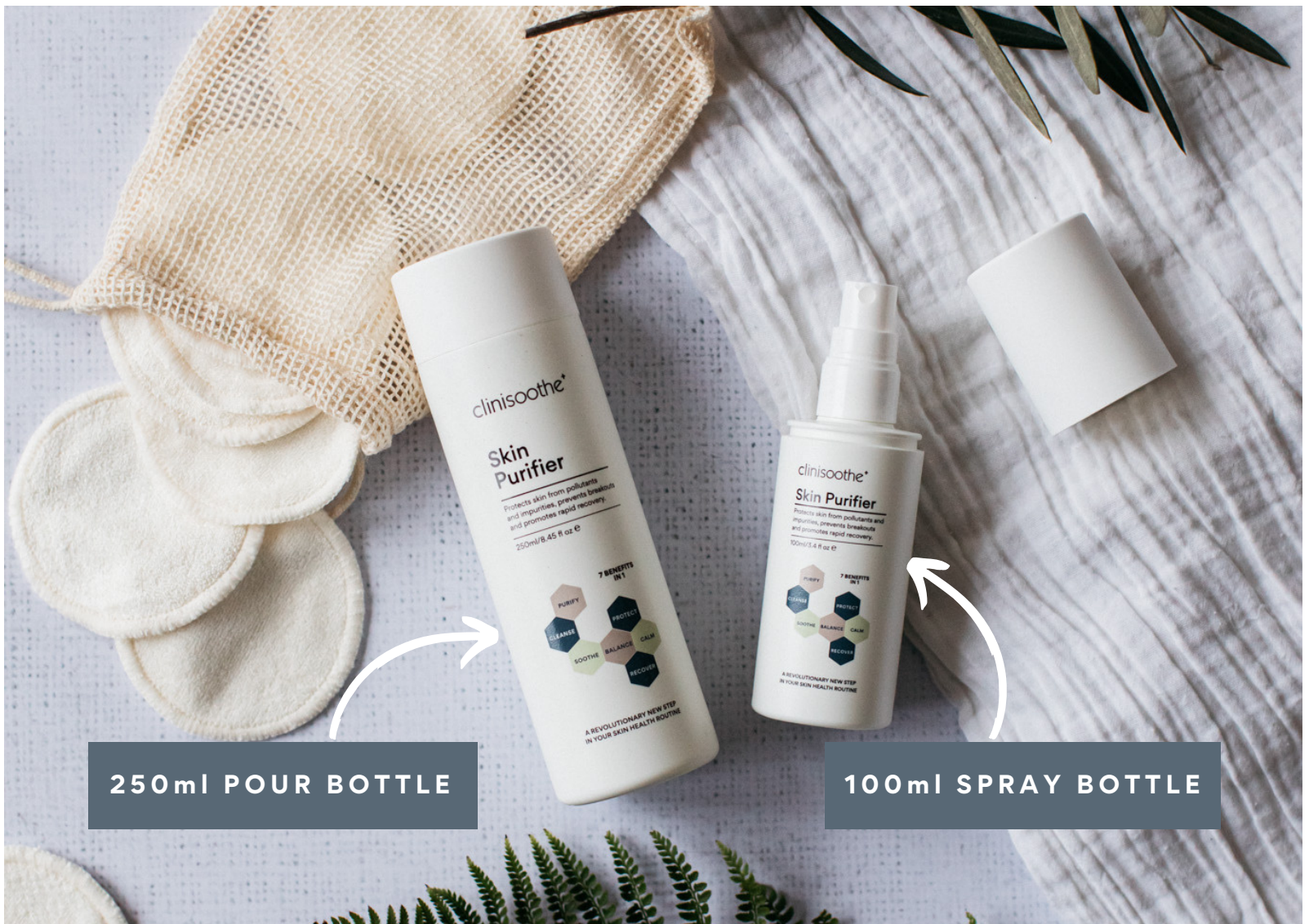
250ml POUR BOTTLE